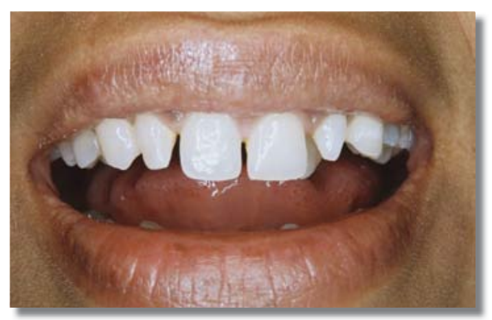
Fig 1. Both lateral incisors were peg shaped. The upper left canine was palatally placed while the deciduous canine was retained.

In theory it should be possible to treat a peg shaped lateral with mesio-incisal and disto-incisal restorations. In practice the margin