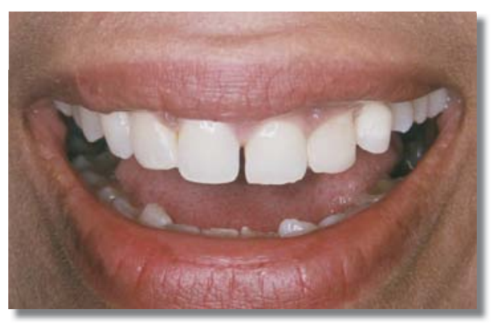
Fig 6. The completed case.

It is difficult to ensure viscous composite always extends fully into crevices between teeth but, if the plastic strip is pulled palatally as the material is applied, friction will drag it interproximally.