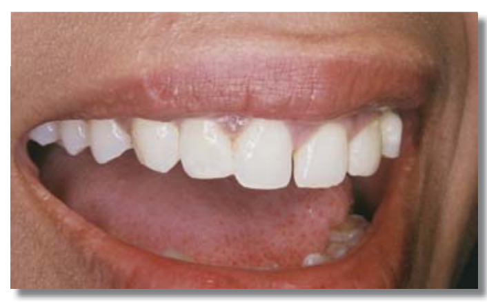
Fig 5. The completed 12 restoration.