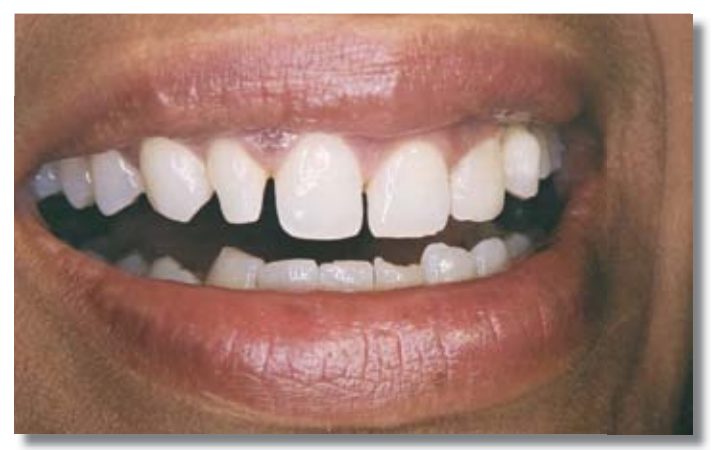
Fig 4. The 12 was to be restored at the following appointment.