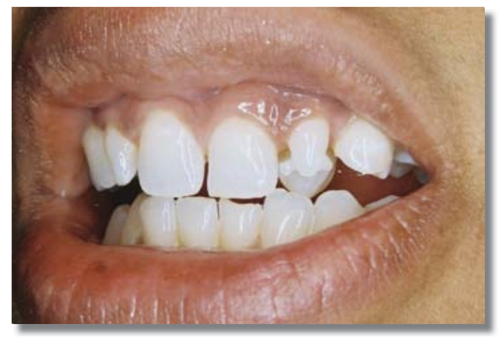
Fig 2. Wings of composite resin were created on the mesial and distal walls to support plastic matrices and encourage a taper of the proximal walls.

The 22 was cleaned with a rubber cup and pumice and a blunt fluted bur around the cervical. Enamel was etched and washed and adhesive applied and cured.