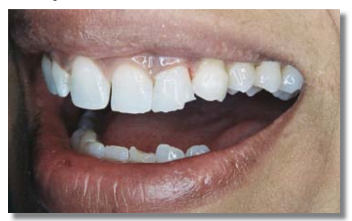
Fig 3. The overlaying of different shades of composite resin was designed to give the tooth an appearance of depth and realism.

To aid the flow of the next layer and prevent voids, this initial build up was smeared with a small amount of resin adhesive, blown with air and left uncured. Using plastic matrices angled into the cervical margins, B1 was then placed mesially and distally and manipulated onto the labial, over the earlier material, and onto the incisal (Fig 3).